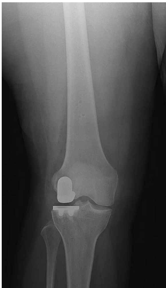
FIGURE 4. A right knee postoperative anteroposterior radiograph of a 56-year-old female following lateral robotic unicompartmental arthroplasty.

at an average of 2 years after robotic lateral UKA (Figs. 3, 4). The average age of patients was 63 \pm 13 years, body mass index was 26.35 \pm 4.7 , and Kellgren-Lawrence (K-L) grade was 2.5 \pm 1 . Preoperatively, the mechanical axis of the operating leg was on average 4.1 degrees of valgus, which improved to 1.64 degrees postoperatively.