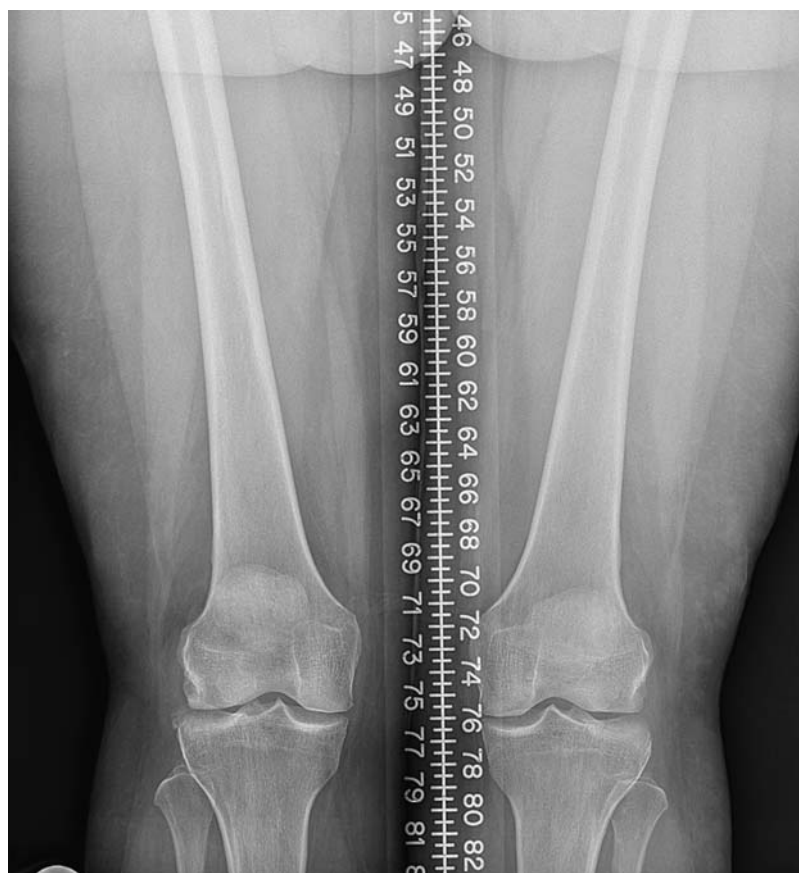
FIGURE 3. A right knee preoperative anteroposterior full weight-bearing radiograph of a 56-year-old female with lateral compartment degenerative changes.